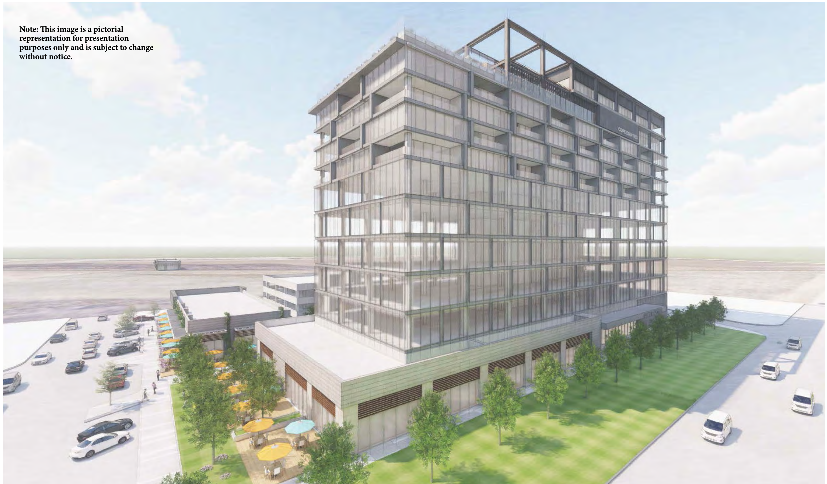
Gateway Allen at Twin Creeks Tollway West Character Area - Tract 6A

Note: This image is a pictorial representation for presentation purposes only and is subject to change without notice.