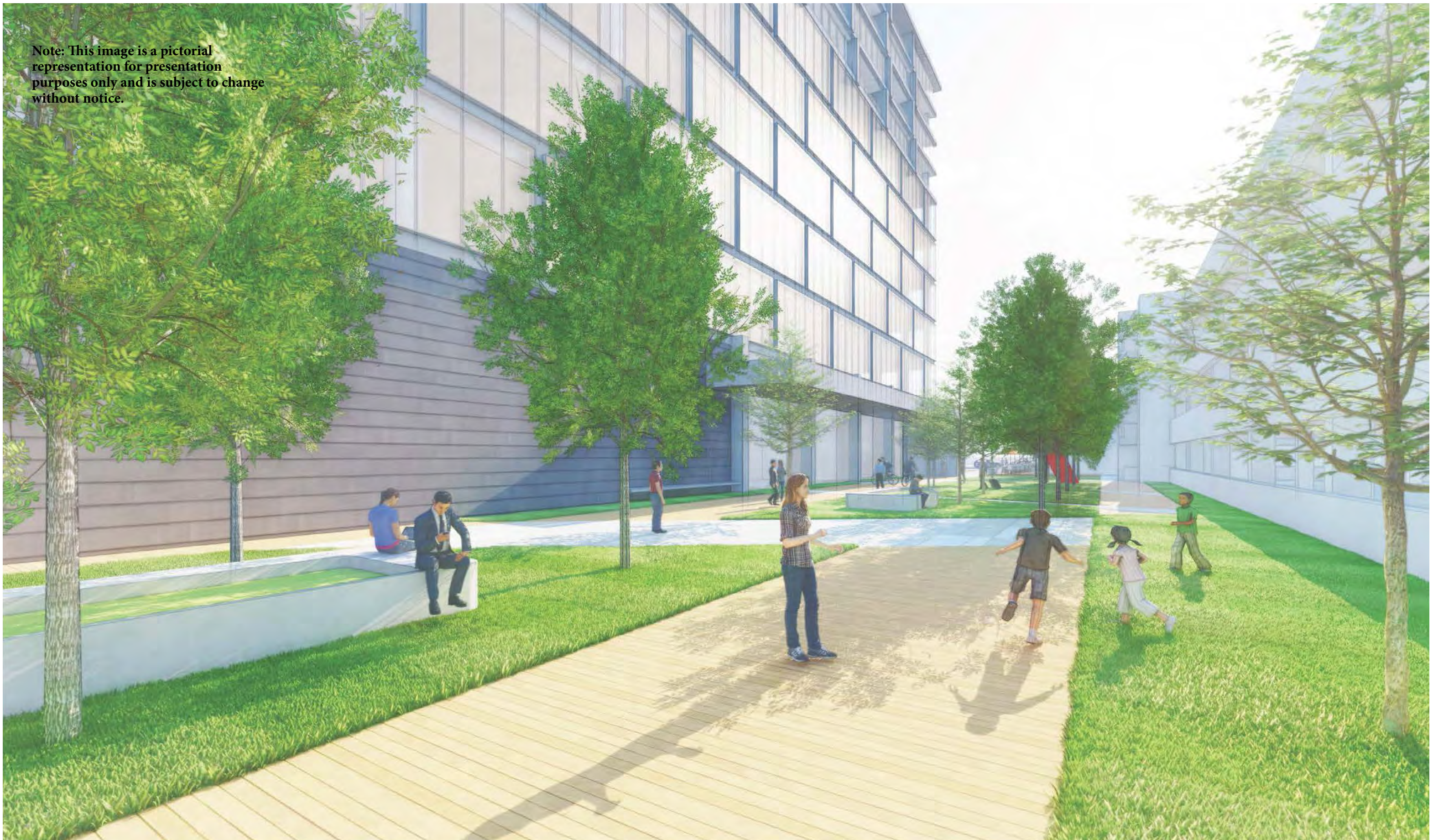
Gateway Allen at Twin Creeks Tollway West Character Area - Tract 6A

Note: This image is a pictorial representation for presentation purposes only and is subject to change without notice.