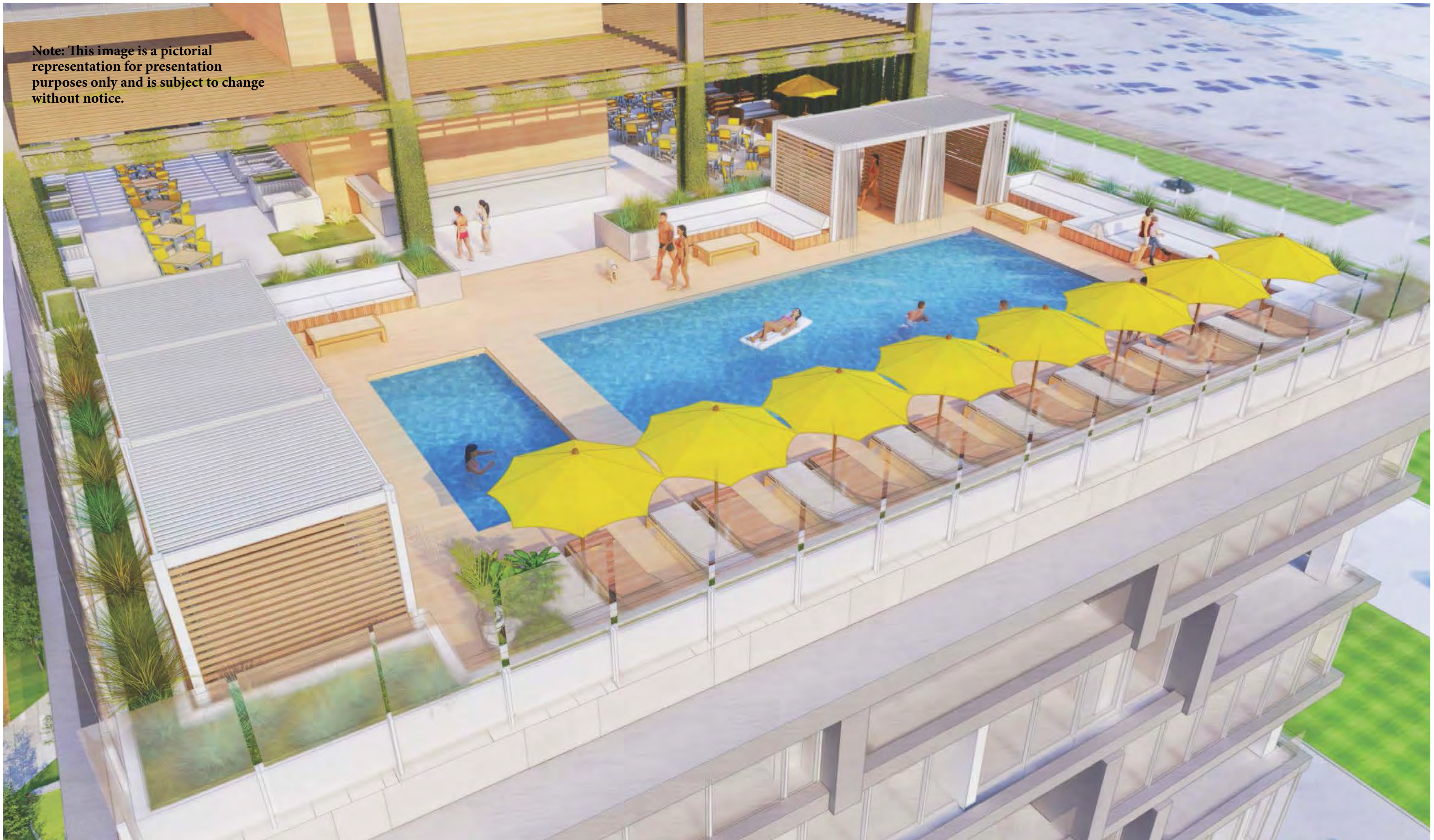
Gateway Allen at Twin Creeks Tollway West Character Area - Tract 6A

Note: This image is a pictorial representation for presentation purposes only and is subject to change without notice.