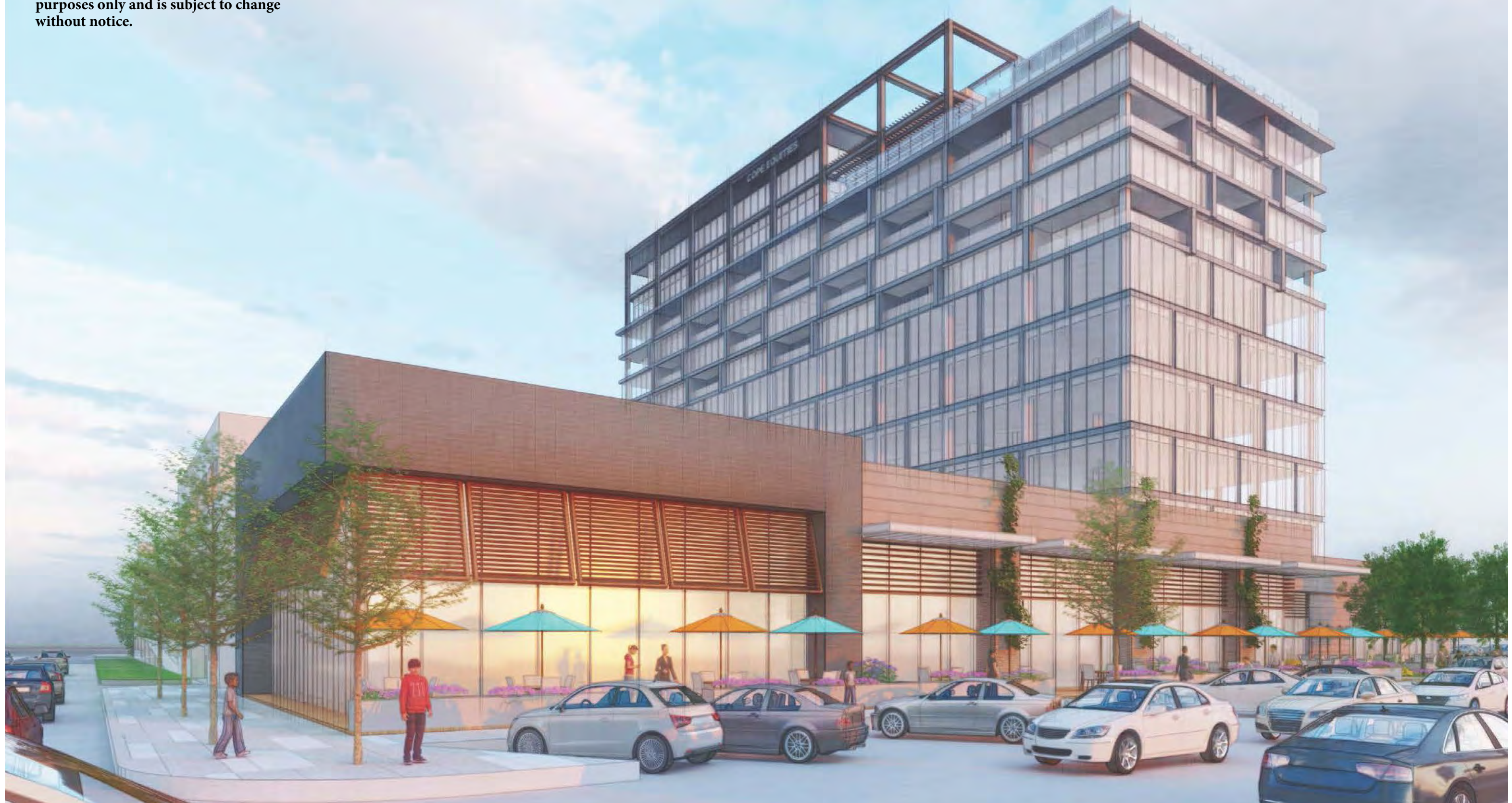
Gateway Allen at Twin Creeks Tollway West Character Area - Tract 6A

Note: This image is a pictorial representation for presentation purposes only and is subject to change without notice.