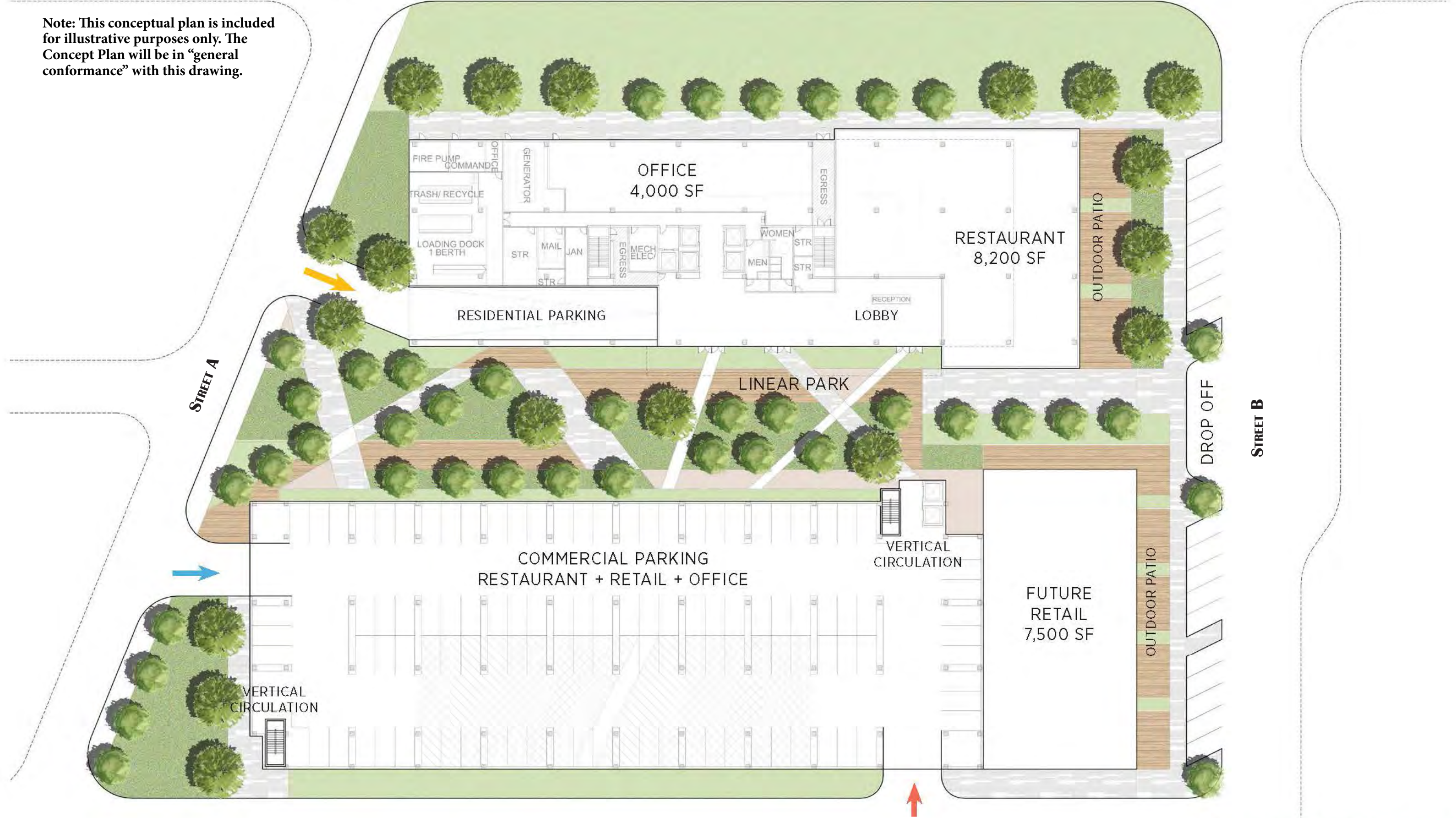
Gateway Allen at Twin Creeks Tollway West Character Area - Tract 6A

Note: This conceptual plan is included for illustrative purposes only. The Concept Plan will be in “general conformance” with this drawing.