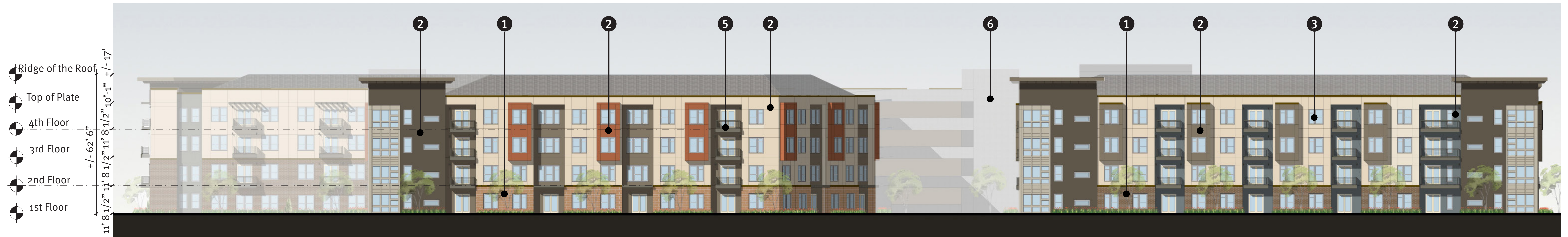
01 South Elevation