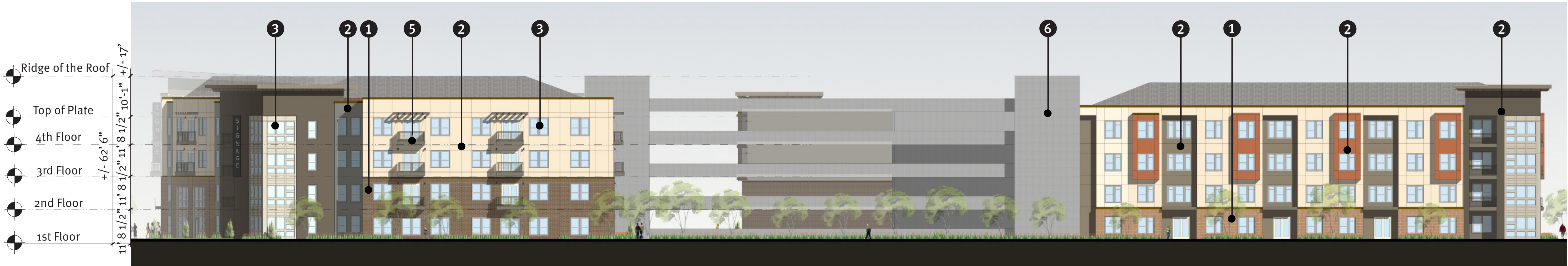
02 West Elevation