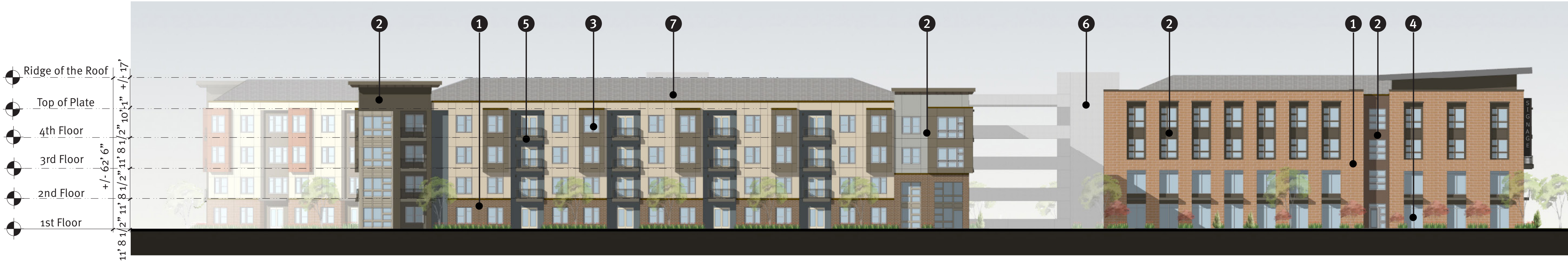
02 East Elevation