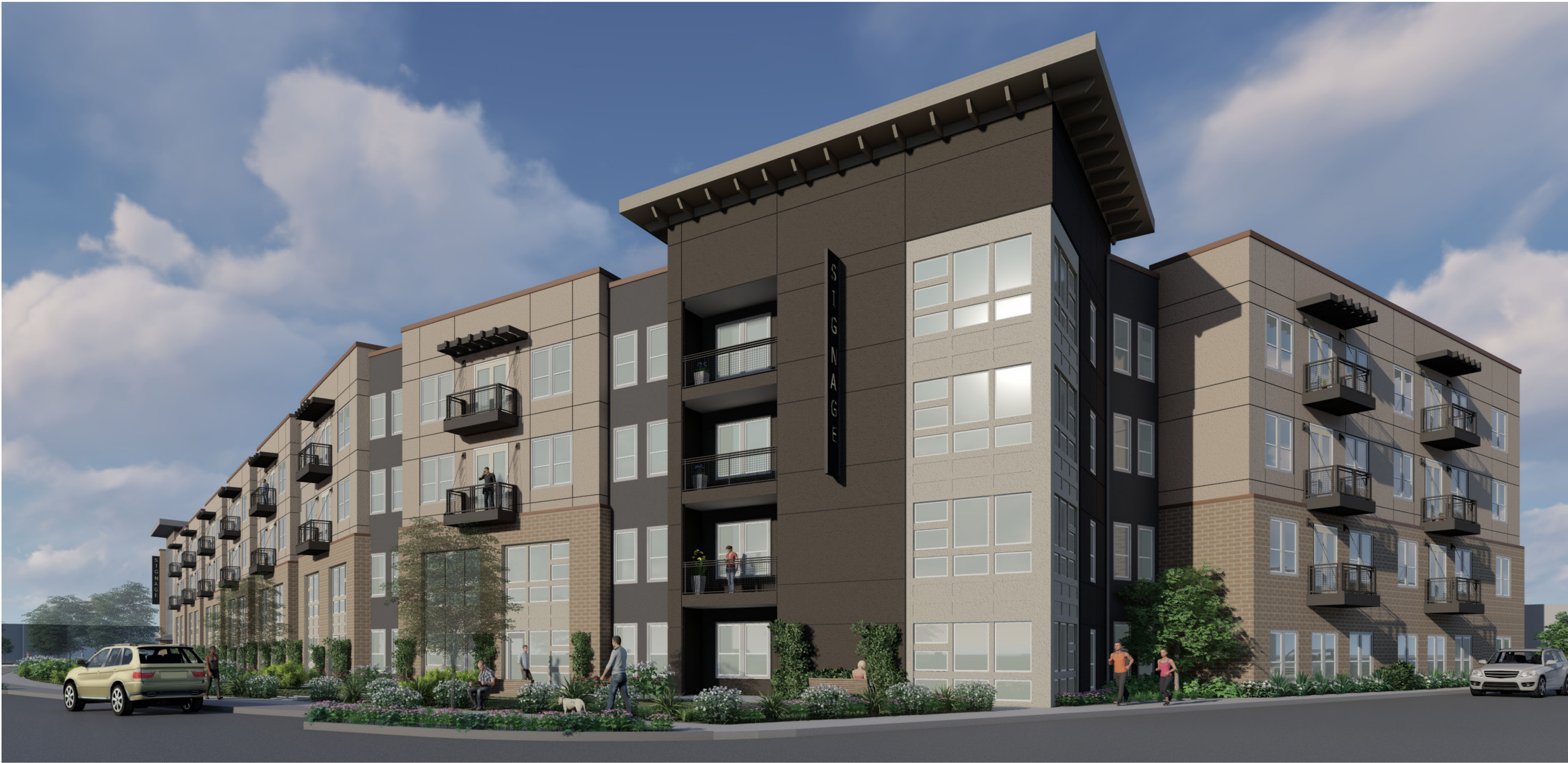
01 Northwest Corner Perspective