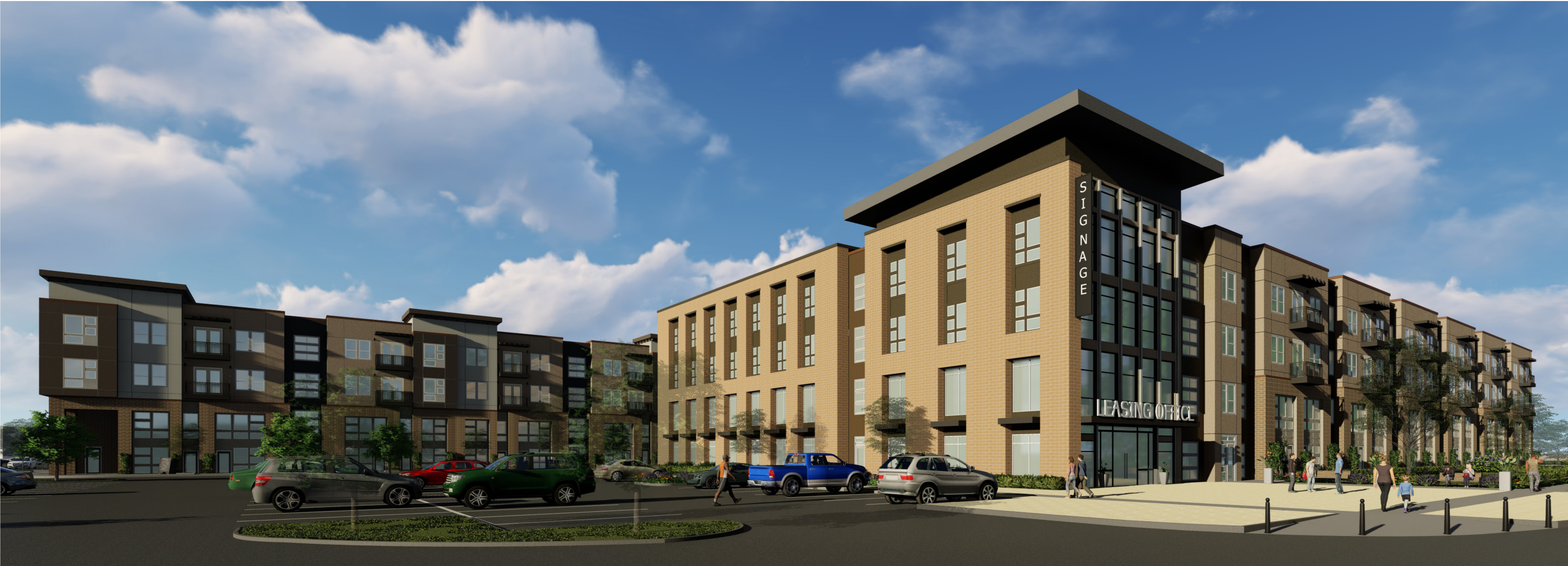
01 Northeast Corner Perspective