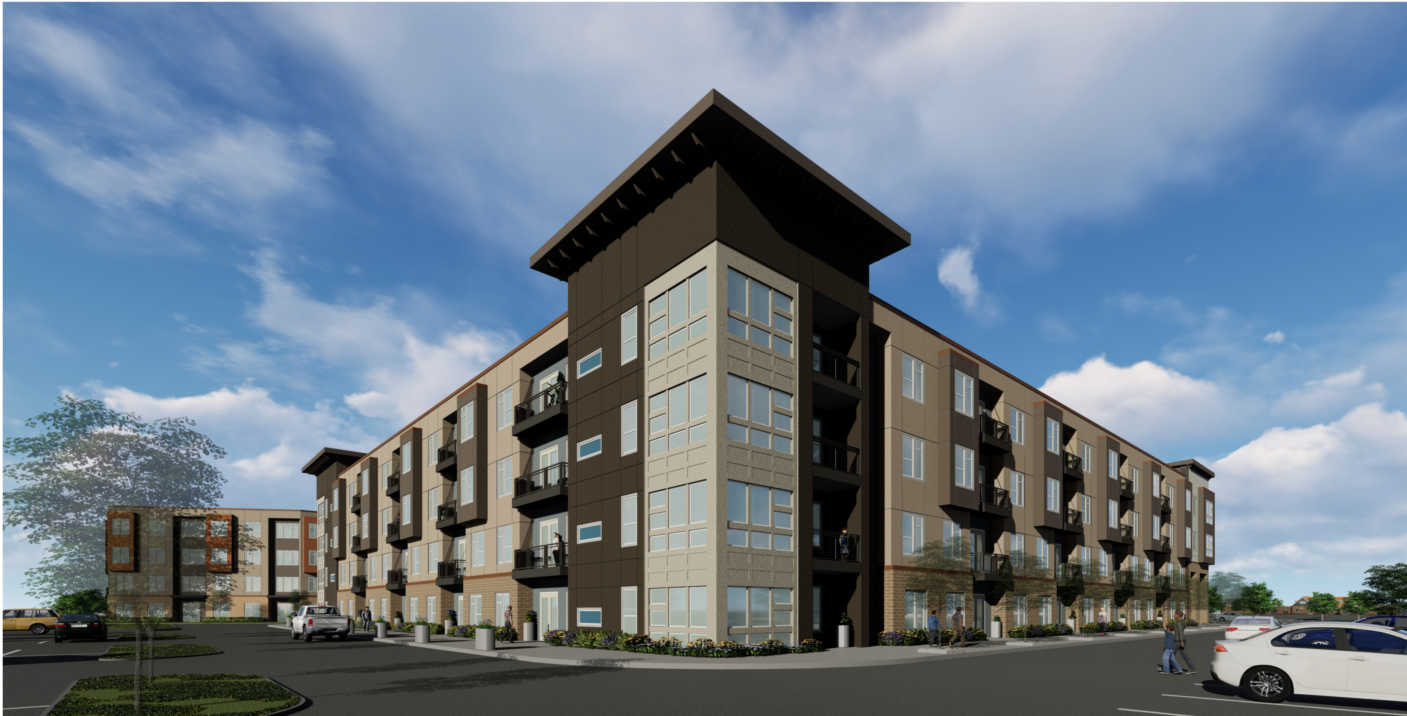
01 Southeast Corner Perspective