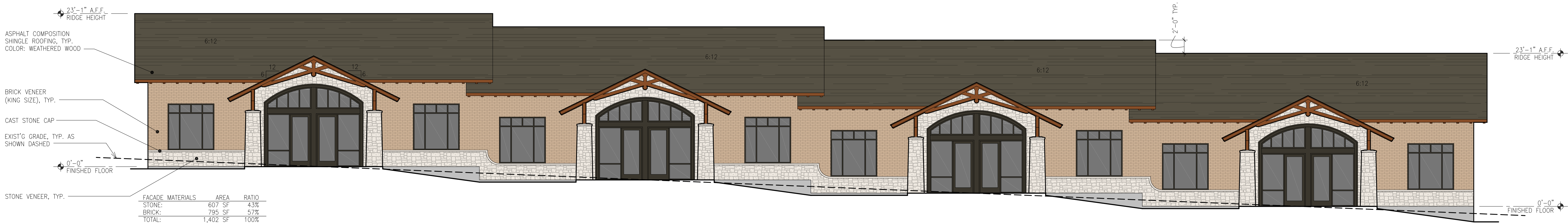
NORTH (FRONT) ELEVATION SCALE: 1/8"=1'-0"