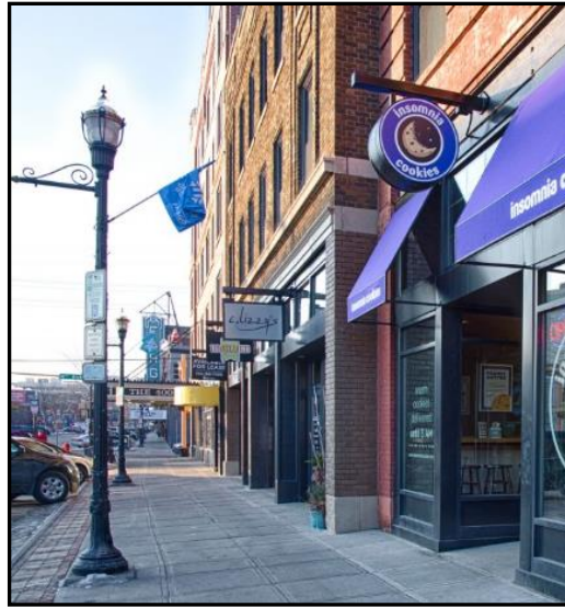
Sample Hanging/Projecting Signage