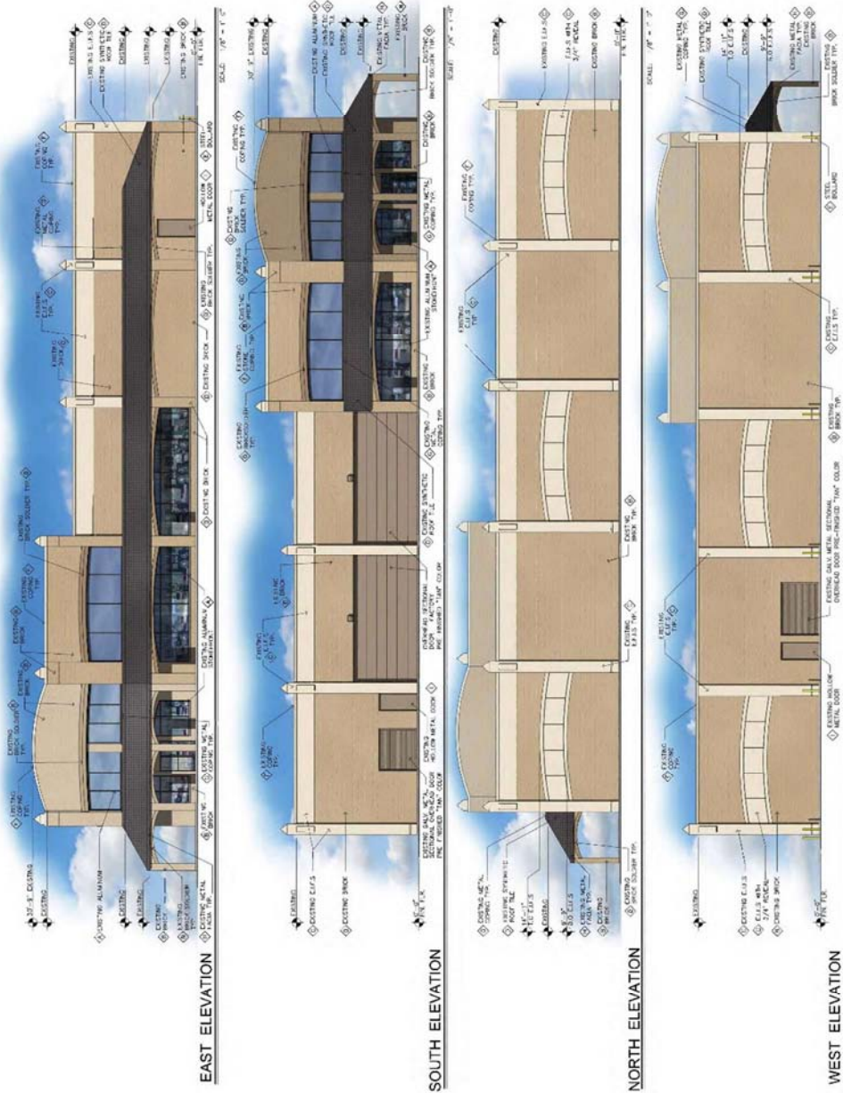
EXHIBIT "C" ELEVATIONS