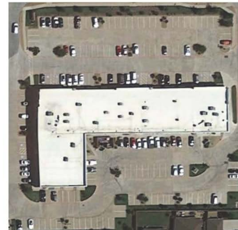
EXHIBIT "A" SUP SUITE PLAN